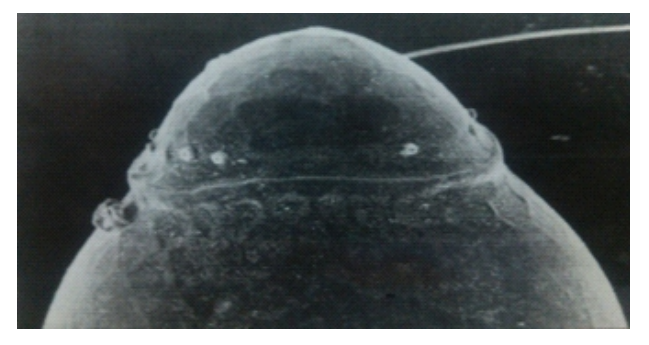
Fig. - 4: Showing operculum of egg of Campanulotes bidentatus compar (enlarged) X 330